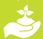
6. Food & Garden