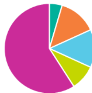
Years lived in current community

■ < 1 year ■ 1-2 years ■ 3-4 years ■ 5-10 years ■ 10+ years