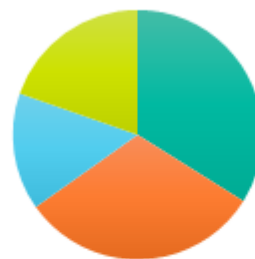
How did we do?